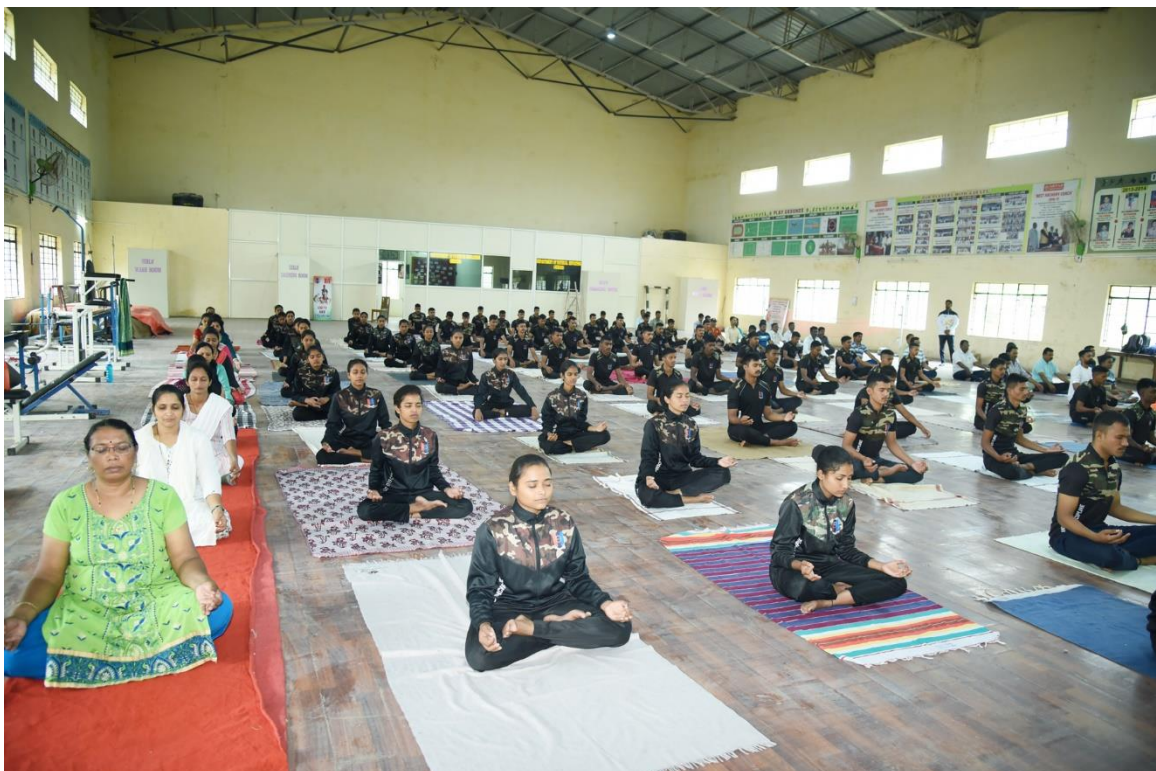
NCC Cadets and Staff doing Yoga